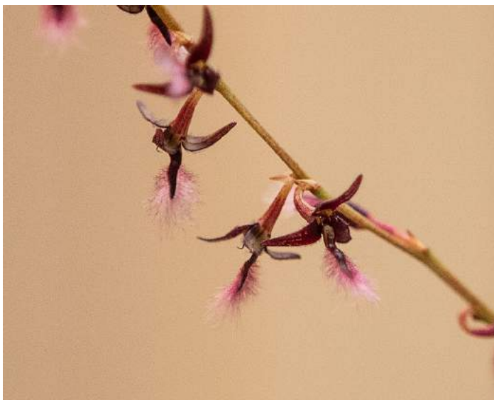
Misc. Species a & Hybrids