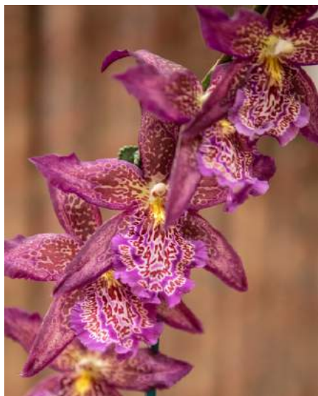
Oncidium Species & Hybrids