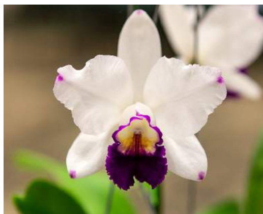
Small Flowered Cattleya Hybrid Blc. Shinfong 'Little Boy' Owner: Alida Eldridge