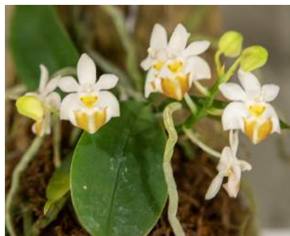
Phal.Species & Hybrids Phal. Lobbii Owner: Unknown