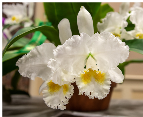
Large Flowered Cattleya Hybrids

. Mary Lynn McKenzie 'Natures Masterpiece' AM/AOS