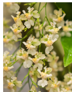
Oncidium Species & Hybrids Onc. Star Twinkle Owner: Alida Eldridge