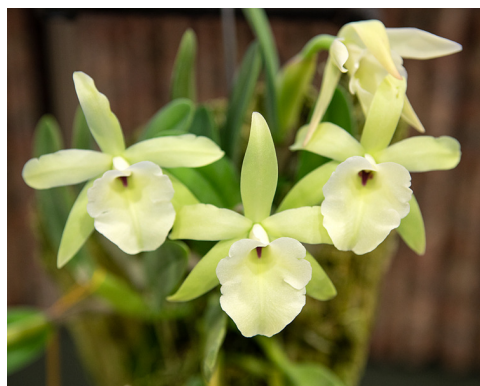
Cattleya Alliance Species