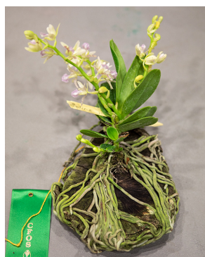
Phal. Species and Hybrids Sedirea japonica Owner: ?????