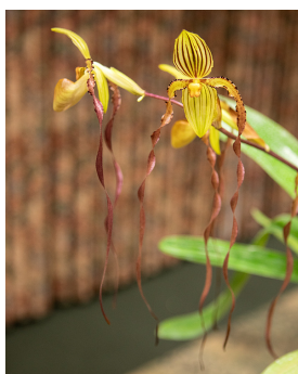
Paph. & Phrags Species & Hybrids Paph. Michael Koopwsitz Owner: ?????