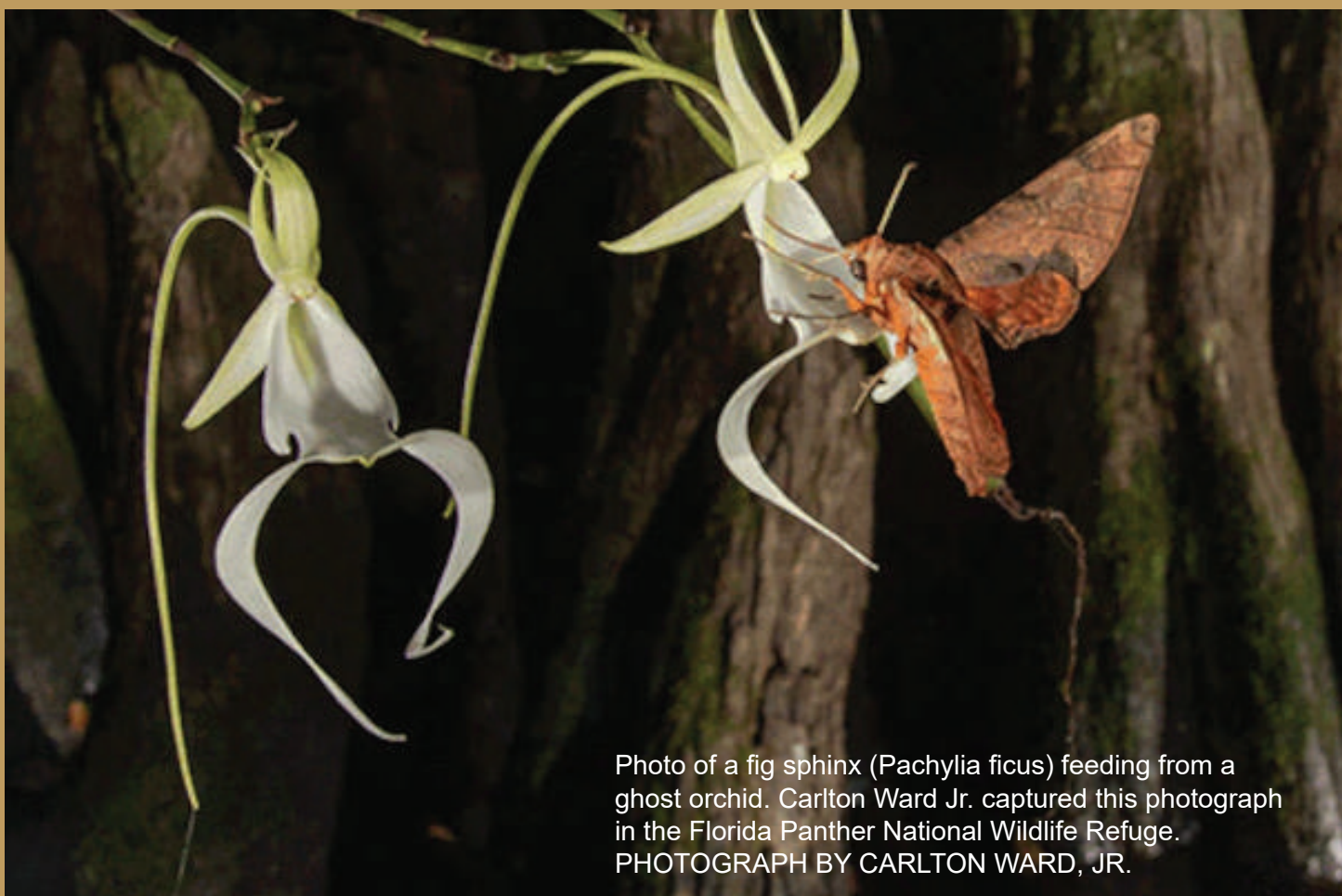
Photo of a fig sphinx ( Pachylia ficus ) feeding from a ghost orchid. Carlton Ward Jr. captured this photograph in the Florida Panther National Wildlife Refuge.