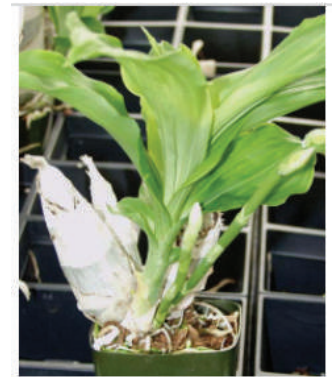
Fully rooted plant. Top growth 10". Water and fertilize regularly.