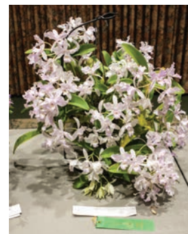
Misc. Species & Hybrid C. Skinneri Alba Owner unknownv