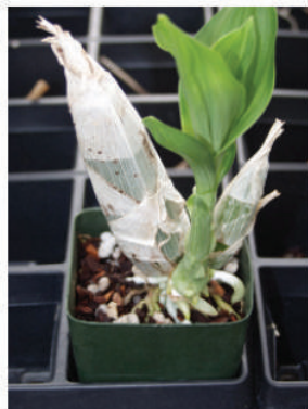
No water. Roots just starting to show.