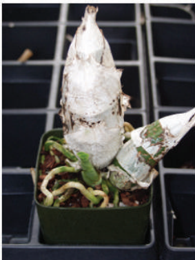
No water. Growth just started

Here are the stages of growth and root development