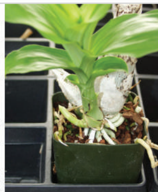
Start watering now. Roots 3- 6"long and into the medium.