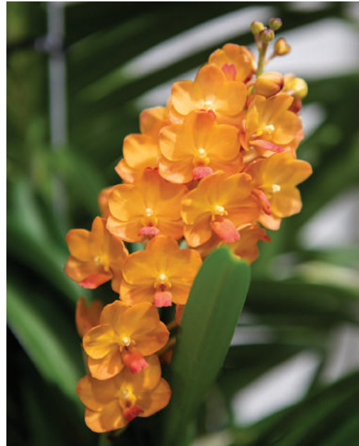
Small Vanda V. Pearl Cooper 'Sunkiss' Owner Unknown

Don't forget to bring in your blooming beauties for judging each month. You might win a ribbon too!