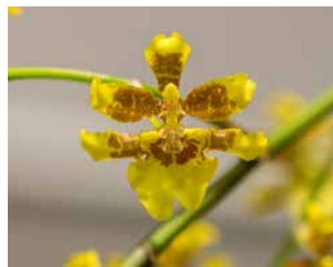
Oncidium Species & Hybrid Onc. Sphacelatum Owner Clark Woodsby

Don't forget to bring in your blooming beauties for judging each month. You might win a ribbon too!