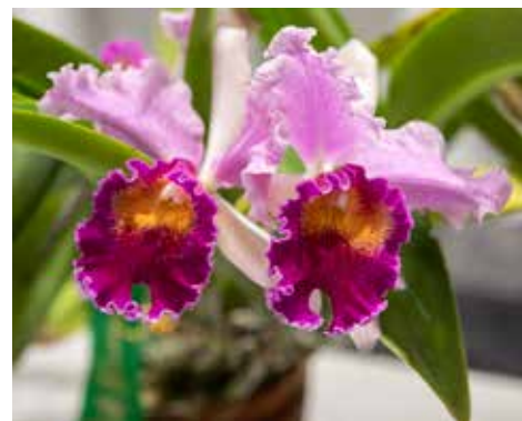
Pot. Susan Fender 'Cinnamon Stick' x Rlc. Hilo Grand

Unfortunately, due to technical difficulties owner's names are not available for these January winners. Also the photos of winners from the February meeting have not been provided. Hopefully we can get back on track for March's meeting.