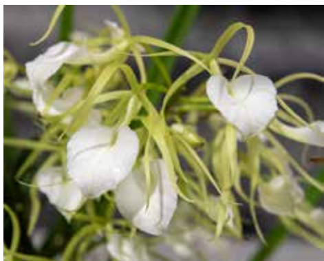
B. Little Stars