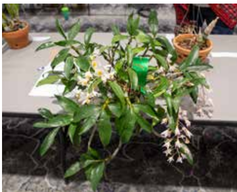
Den. Farmeri var. Pink