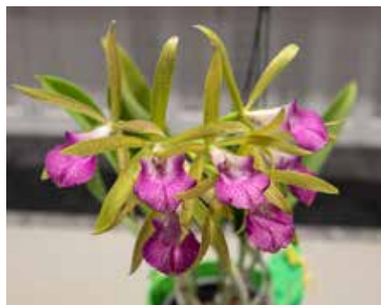
Small Cattleya Alliance Bc. Nodata Owner The Foxes