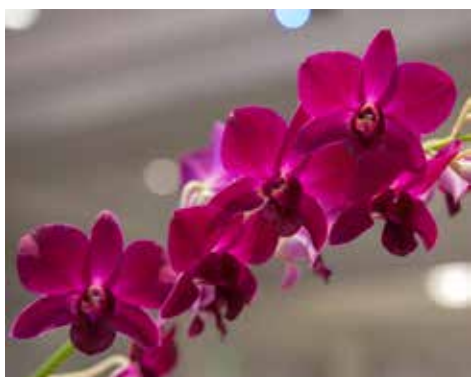
Deciduous Dendrobium NOID Owner Unknown