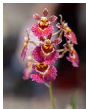
Equitant Oncidiums Tolumnia Jarik Firm 'Barbie' Owner Unknown