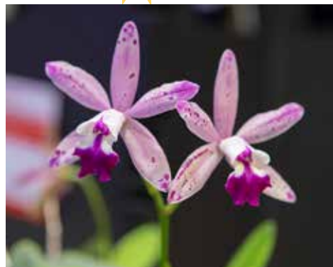
Sm Cattleya Alliance SLC Tropical Pointer Owner Unknown