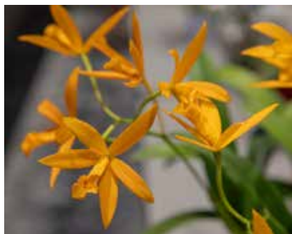
Sm Cattleya Alliance Hybrid Blc. Hawaiian Treat Owner Unknown