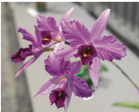
Laelia Anceps Lineata