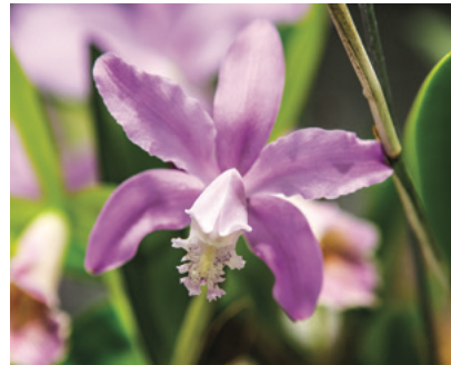
Cattleya Alliance Hybrid