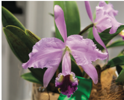
Lg Cattleya Alliance Hybrid