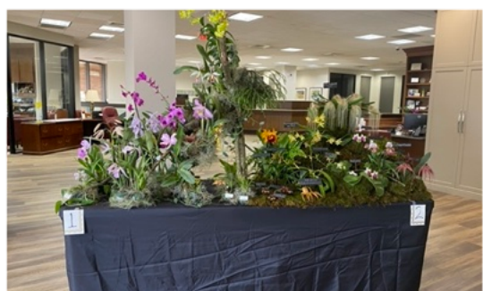
Krull/Smith Nursery & Ecuagenera