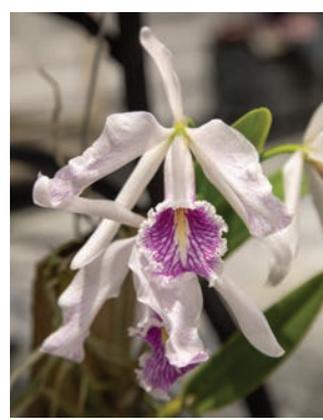
Lg. Flower Cattleya Hybrid C. maxima 'La Pedrena' Owners Giselle Porto