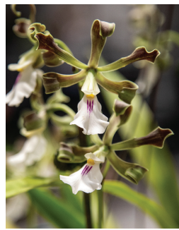
Cattleya Hybrid Enc. pyriformis Owner Unknown