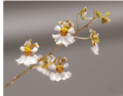
Equitant Oncidium Tolumnia variegata 'Mary Ida' Owner Unknown