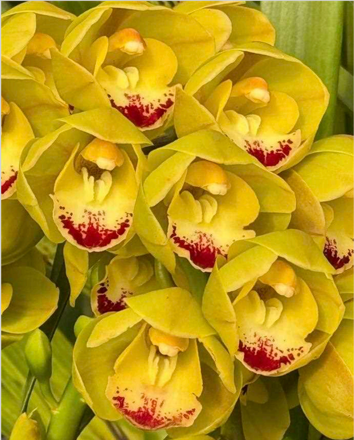
Cymbidium Carmel Split 'Masterpiece'