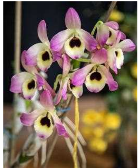
Den. Oriental Smile 'Butterfly' owner N/A